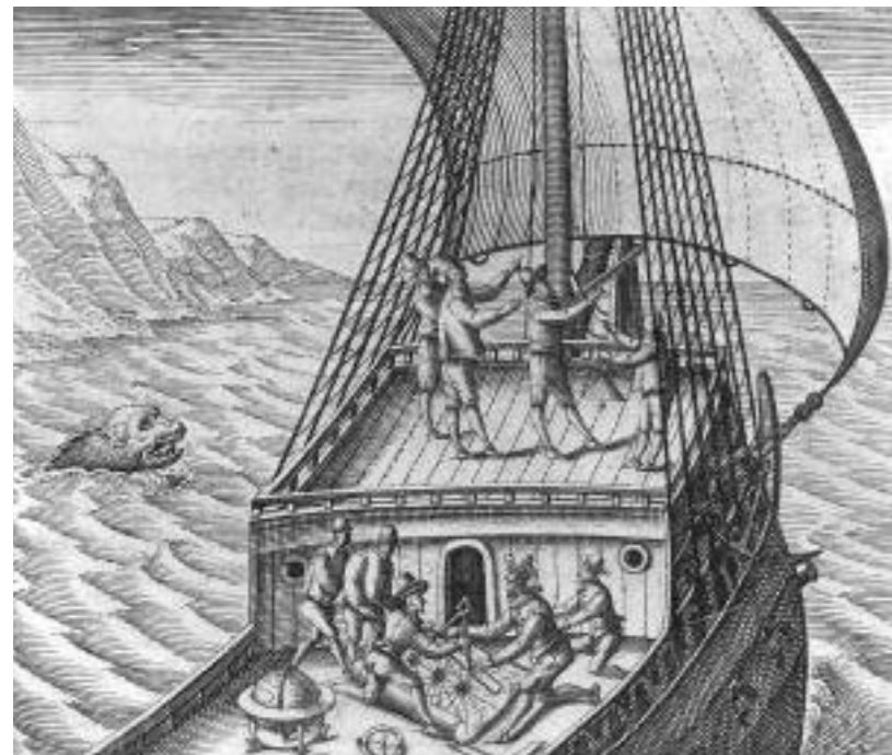
View of a ship's deck with a marine astrolabe and globe. Sailors are working on a chart with pair of compasses and a ruler. Another is on the foredeck measuring height with a cross staff (Jacob's staff). To his right is a man holding a quadrant.