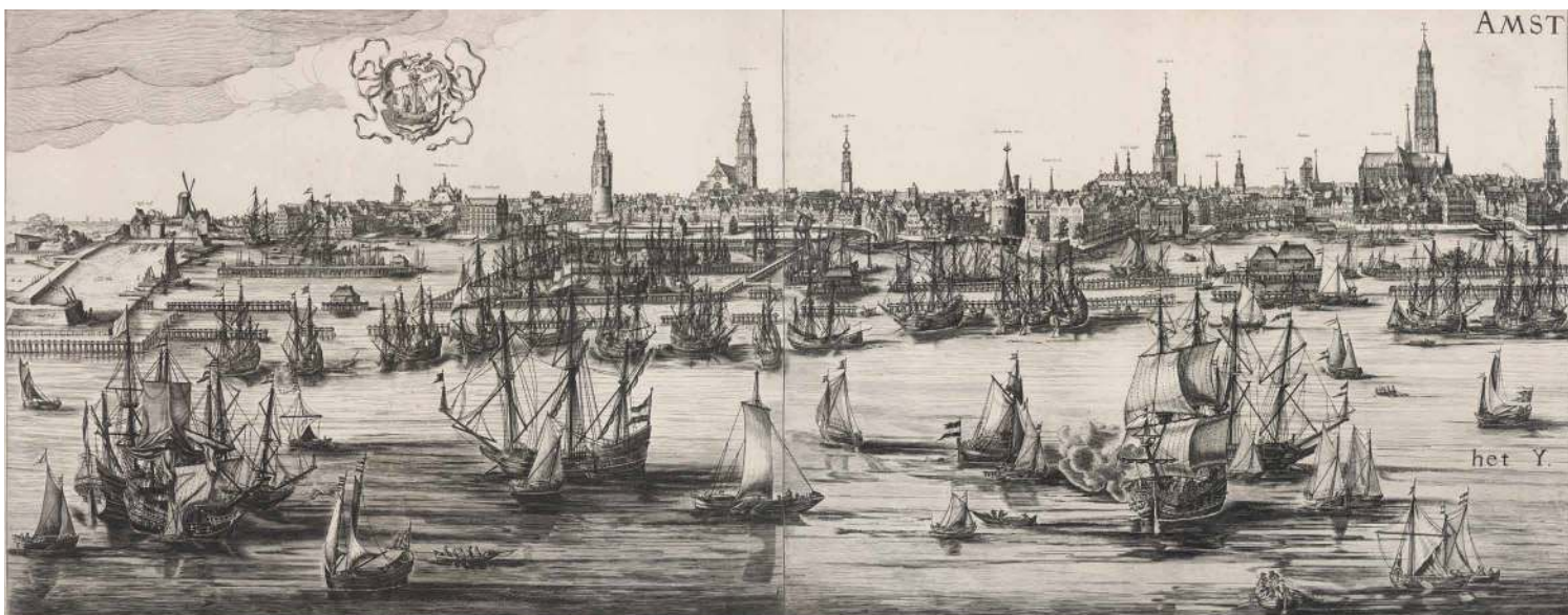
Fig. 16 C.J. Visscher Skyline of Amsterdam seen from the IJ, c. 1650 Etching on four sheets, 41.6 x 215 cm Rob Kattenburg Collection

Viewpoint of Willem van de Velde the Elder, looking north-east from the Old City Inn of Amsterdam.