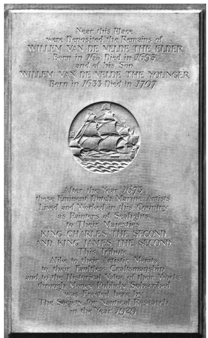
Fig. 7 The memorial stone in St James's Church, Piccadilly, London, UK

After the Year 1673 these Eminent Dutch Marine Artists Lived and Worked in this Country As Painters of Seafights To Their Majesties KING CHARLES THE SECOND AND KING JAMES THE SECOND This Tribute Alike to their Artistic Merits To their Faultless Craftsmanship And to the Historical Value of their Works through Money Publicly Subscribed was Erected here by The Society for Nautical Research In the Year 1929