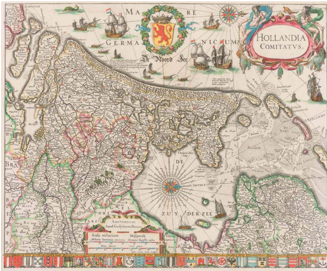
Fig. 2 WILLEM JANSZ BLAEU HOLLANDIA | COMITATUS. t' Graefschap Hollandt. | Van niew verbeteret ende vermeerderd | door Willem Janszoon [ Blaeu]. / Iosua vanden Ende sculpsit [map]. Engraving, 36.6 x 48 cm Second state, 1631 Rob Kattenburg Collection