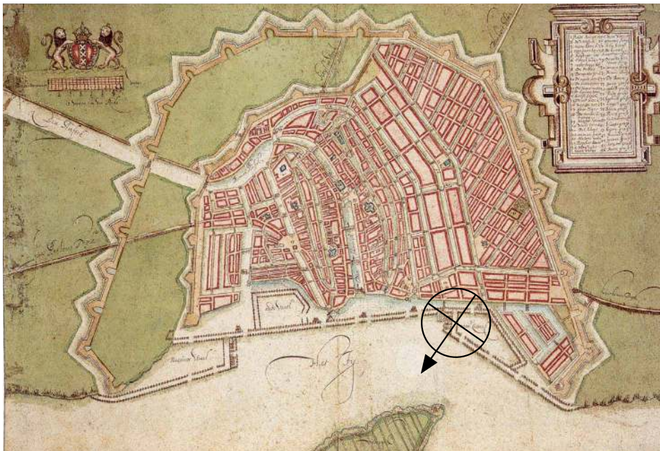
Fig. 14 Anonymous artist Amsterdam 1623-1626 Pen in brown, brush in colour, 32.6 x 47.7 cm Amsterdam City Archives, inv. no. 10035/406

The original inn was renamed the Old City Inn when the second one was built in 1661.