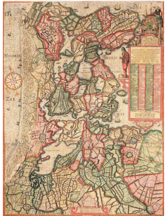
Fig. 10 Joost Jansz Beeldsnijder Land caerte ende water caerte van Noort Hollandt ende West-Vrieslandt met d'aenliggende landen Engraving, 93.7 x 70.3 cm Second state, 1608 Scale: 1:100,000 Beeldbank Noord-Hollands Archief Collectie Provinciale Atlas - Kaarten en kaartboeken, photo no. 2436.

The positions that the two artists took up are shown in the detail of the map of North Holland below. They were in an area that provided a good view of the far shore of the IJ. Rembrandt was looking due north, Willem van de Velde north-east. The latter's depiction is a rare historical document, since artists usually preferred the opposite view, looking towards Amsterdam.