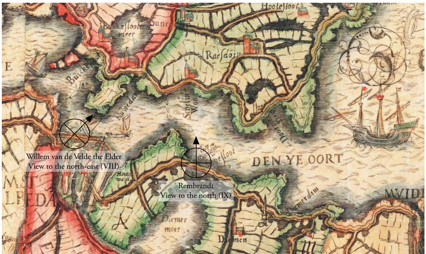
Fig. 11, Detail of fig. 10