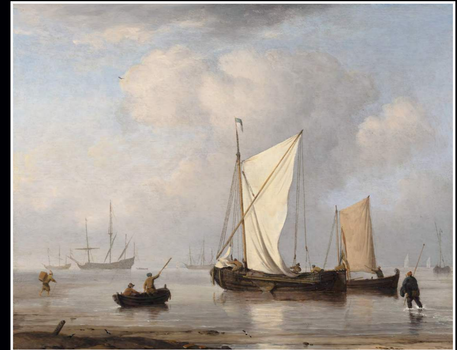
A Calm by Willem van de Velde the Younger The Greatest Marine Painter of the Seventeenth Century