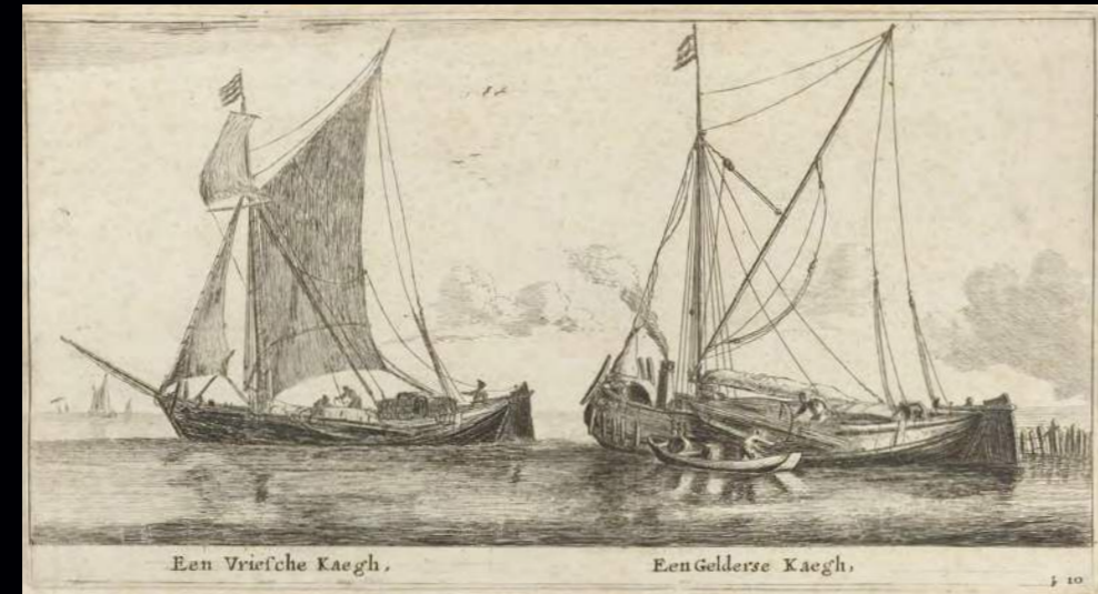
Reinier Nooms A 'kaag' Etching 20.5 x 30.0 cm Rob Kattenburg Collection