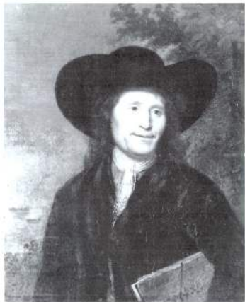
Portrait of William as a Child by the Fides. Oil on canvas, 1771 x 2 cm. London: National Maritime Museum.