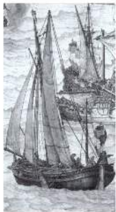
Willem van de Velde: The Batavia of Scheerwateringen (The Mermaid) , 11 July 1653. Pen painting on canvas, 7 1/2 x 10 1/2 on slip and dated 'W. de Velde 1653' in gilded van de Velde's characteristic, ribbon-shaped, Dutch initials (foreground) Willem van de Velde at work on board his galleon.

Van de Velde probably produced his first pen paintings around 1645, and they were so skilful that it soon became a very popular art form. His patrons included the Tromp family, who commissioned a series