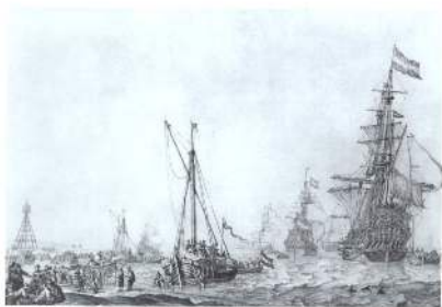
Willem van de Velde the Elder. The Merchant Fleet Sailing for the Sound on 9 June 1645. Executed by 37 Men-of-War Under the Command of Willem de With. Pen painting on paper. 71 x 105.5 cm. Leiden, Stedelijk Museum De Lakenhal.

Van de Velde was evidently present when the fleet sailed, for he made a number of drawings of the event which he later used for several pen paintings, specimens of which are in the Lakenhal in Leiden and the National Maritime Museum in Greenwich.