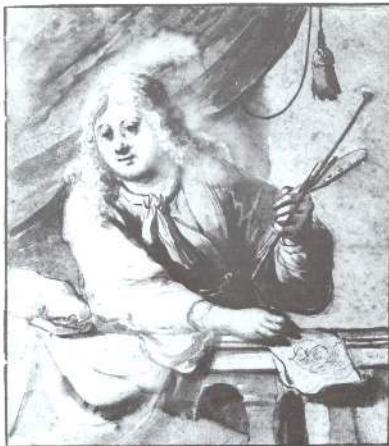
Ludolf Bakhuizen: Self-portrait, ca 1760. Drawing in pencil and brown wash. Amsterdam: Rijksmuseum.